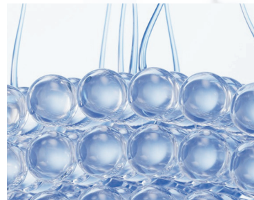
# Sodium Hyaluronate