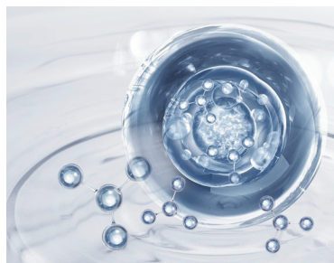
# Hydrolyzed Hyaluronic Acid